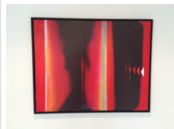
Rose Kallal Procyon , 2016 Ink and acrylic on canvas 24 x 30 inches