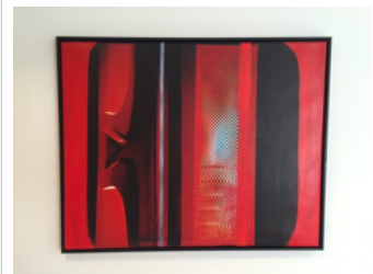
Rose Kallal Thuban , 2016 Ink and acrylic on canvas 24 x 30 inches