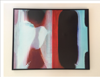
Rose Kallal Mirfak , 2016 Ink and acrylic on canvas 24 x 30 inches

Rose Kallal Four Pillars June 9 - July 2, 2016