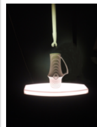
Rose Kallal The Drop , 2016 Lighted pedestal, porcelain KPM Royal vase, wood, cast iron, glass 92 x 40 x 16 inches