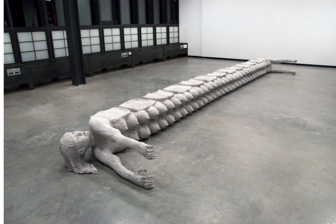
Catalina Ouyang, bitch bench, 2018