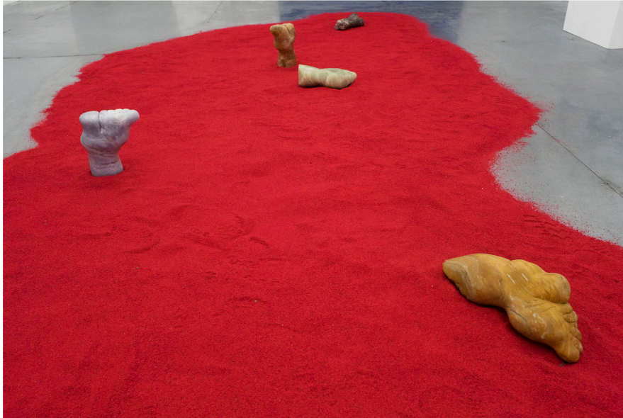
Catalina Ouyang, Terrarium, 2018, red sand, imagined lotus feet of the artist's great-grandmother carved out of alabaster, soapstone and wonderstone, image courtesy of Rubber Factory

“No one is unique. Everything i live has been lived before. I think this is important and beautiful.”