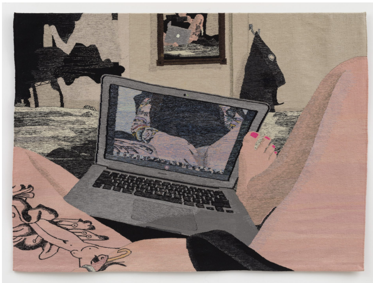
Erin M. Riley, Webcam 2 (2020).