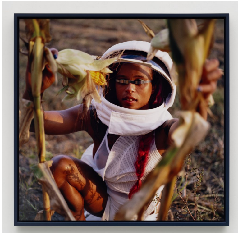
Tourmaline, Violet Copper (2020–21).

The Aldrich Contemporary Art Museum in Connecticut is revisiting its landmark 1971 feminist art exhibition “26 Contemporary Women Artists” with a new twist. Opening next summer, the museum will put artists featured in the original show, including Howardena Pindell, Mary Heilmann, and Adrian Piper, in dialogue with a new crop of emerging women and nonbinary artists for “52 Artists: A Feminist Milestone.”