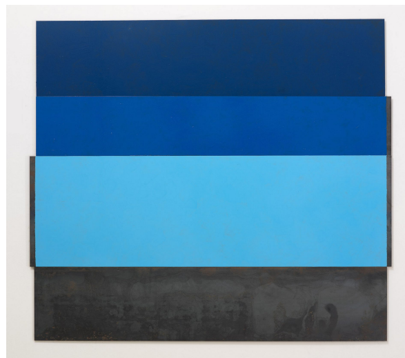
Merrill Wagner, Inlet (2010).

“52 Artists” will highlight the collective cultural impact of both artists and the show as a whole, illustrating their impact on the current generation of women and nonbinary artists.